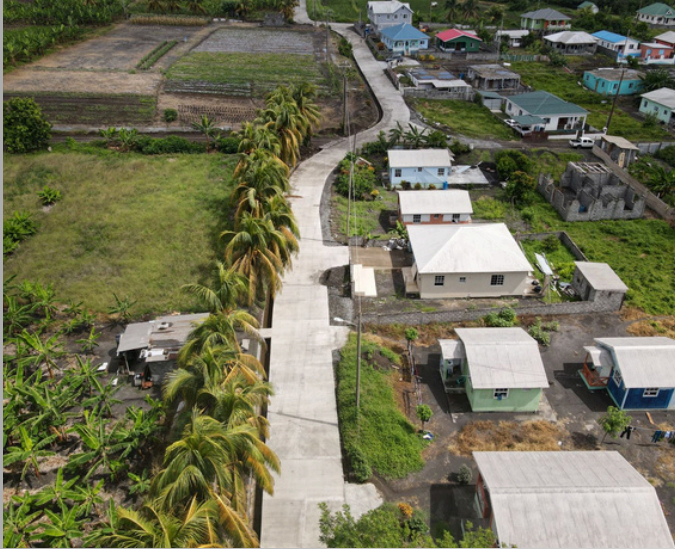
LANGLEY PARK FEEDER ROAD