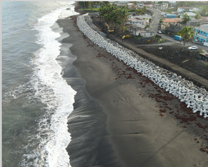
GEORGETOWN COASTAL DEFENCE